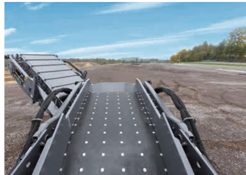
Flexible in use – the optionally available swivel wheel for the BMF 2500 S.