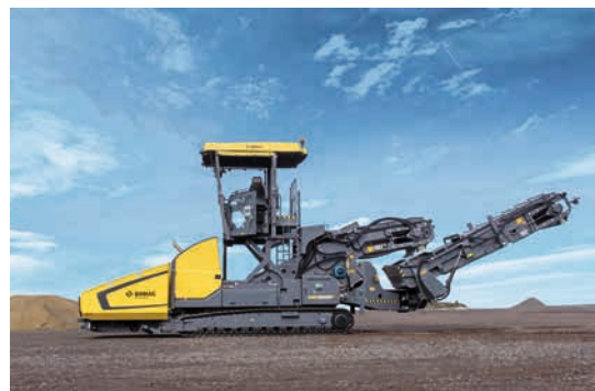
Everything in sight – the optional lift platform provides the best overview.